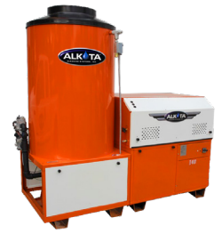
Models 181 / 241/ 301 / 401