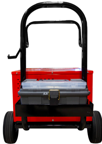
Tool Box Available on 4 wheel cart only