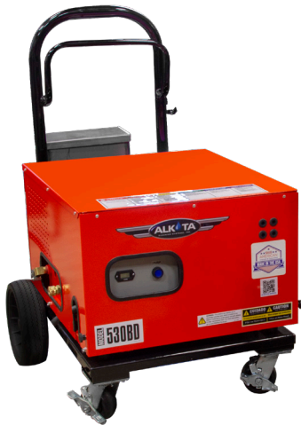
4 Wheel Cart