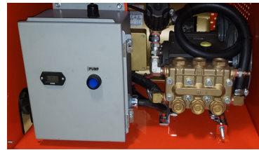
Photo Inside Model 530BD