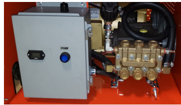
Photo Inside Model 530BD