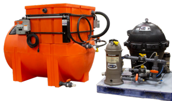
CSF-10 UL CERTIFIED