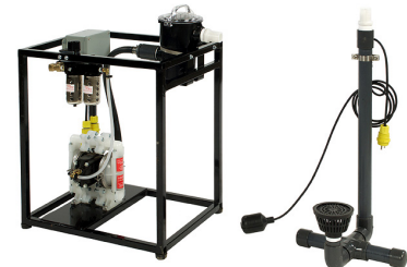
SUMP PUMP KIT