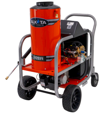
Shown with Castor Wheel Kit Accessory