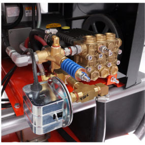
EP1813 Industrial Pump