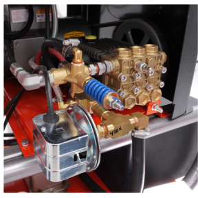
TSS1511 Industrial Pump