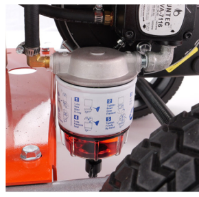
Burner Fuel Filter