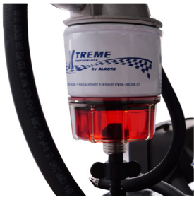
Burner Fuel Filter