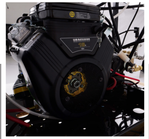
Vanguard 18HP with Electric Start