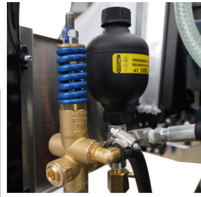
Unloader & Pulsation Damper