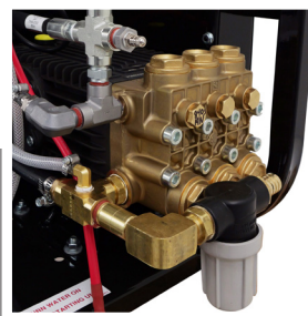
TSF2021 Industrial Pump