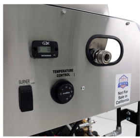
Included hour meter and temperature control