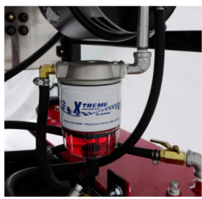
Burner fuel filter