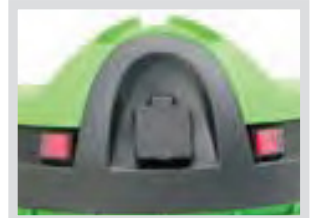
Electric Socket On Board