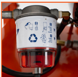
In-Line Fuel Filter